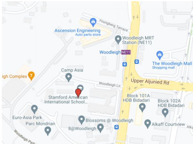
Woodleigh Campus: 1 Woodleigh Lane (Off Upper Serangoon Road), Singapore 357684

International students from more than 77 countries learn together at Stamford American's stunning, bespoke campuses. Located just 10 minutes from popular Orchard Road, the Woodleigh Campus and Chuan Lane Campus welcome students from infant care to Grade 12. The campuses are conveniently linked by a shuttle bus service, making their unique facilities accessible to both parents and students.